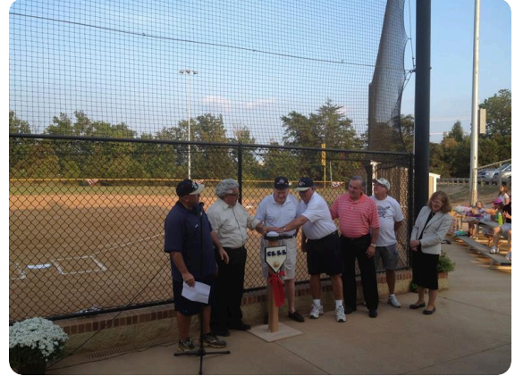
Lighting ceremony at Good Times Park, Sep. 10, 2013