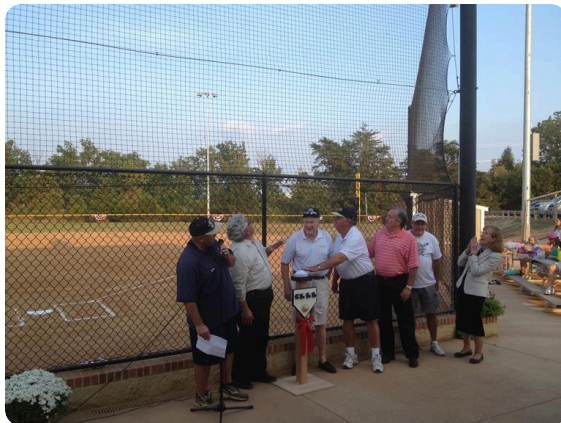
Lighting ceremony at Good Times Park, Sep. 10, 2013