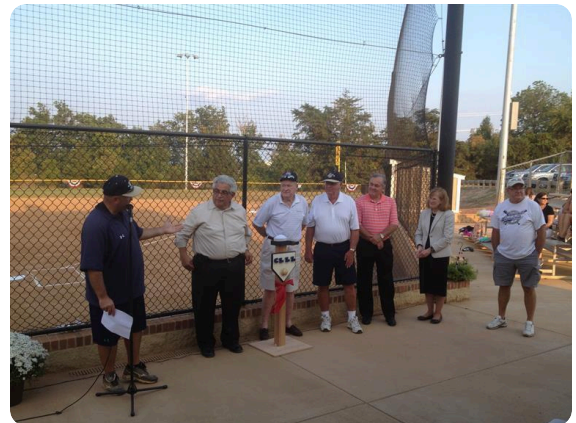
Lighting ceremony at Good Times Park, Sep. 10, 2013