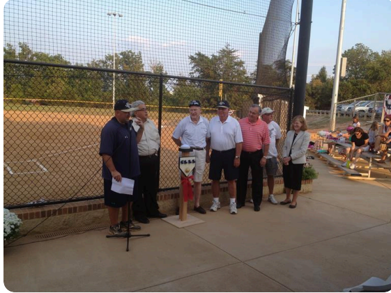
Lighting ceremony at Good Times Park, Sep. 10, 2013